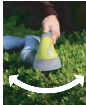
Horizontal trimming fig 2

The Garden Barber has been designed for lightweight trimming of shrubs, hedge area and topiary. For shaping unkempt straggly growth, we recommend adopting a vertical technique (see fig 1), bringing the machine down vertically onto the growth, until the desired length / depth is achieved, then continue to "blend" and shape accordingly.