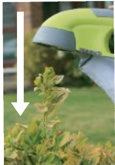
Vertical Trimming fig 1